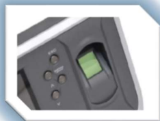
High Powered DSP Chip Finger Sensor